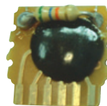
• COB-011C Siren generating chip on board