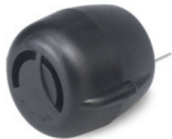
• LD-73 (P.C.B. Mounting Type)