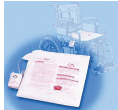
• PD-CHAIR Patent No. 195100