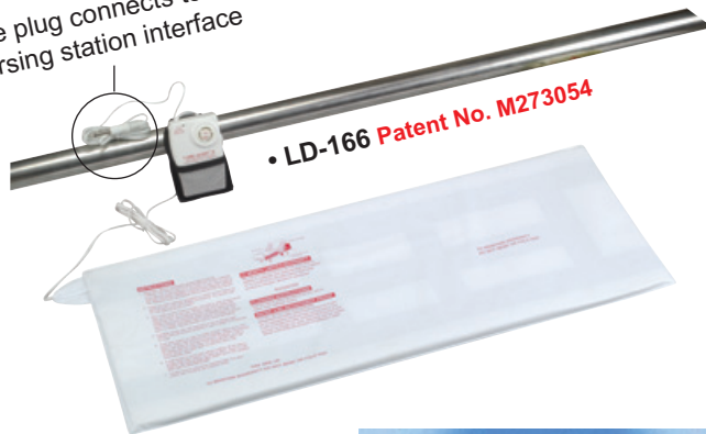
• LD-166 Patent No. M273054

The plug connects to the nursing station interface