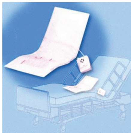
• PD-BED Patent No. 195100

Special anti-slippery bag designed for attaching to any part of the bed frame