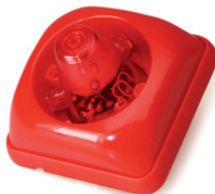
• Lxx-FS100A (with strobe)