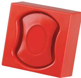
• Lxx-F101 + JB