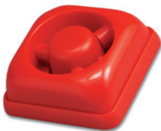
• Lxx-F100A (without strobe)